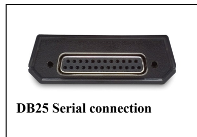
DB25 Serial connection